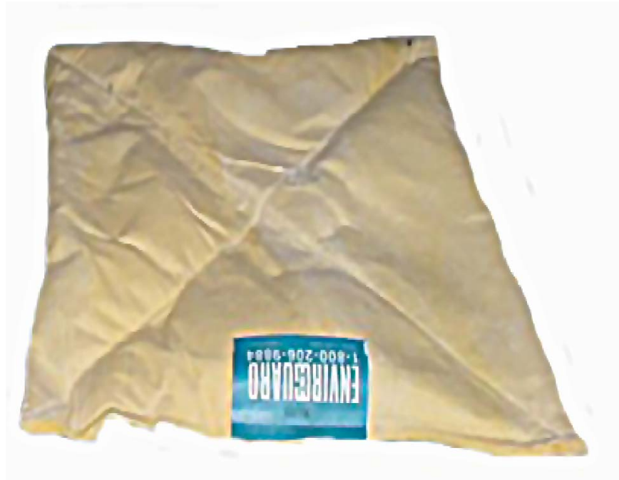
Part Number: VRLAPAD