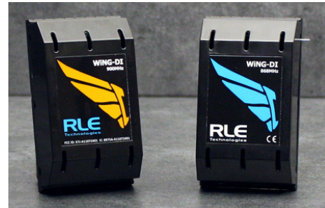
WiNG-DI & WiNG-DI-868