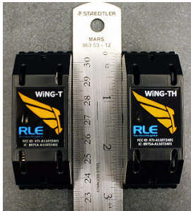
WiNG-T & WiNG-TH