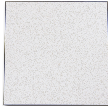
Laminate Topped Panel