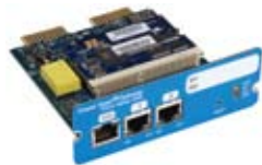
Power Xpert Gateway Card 2000