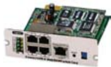
ConnectUPS-X Web/ SNMP X-Slot card