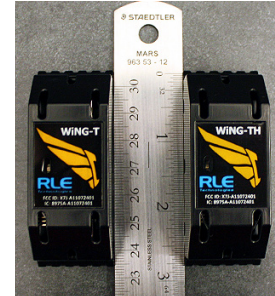
WiNG-T & WiNG-TH