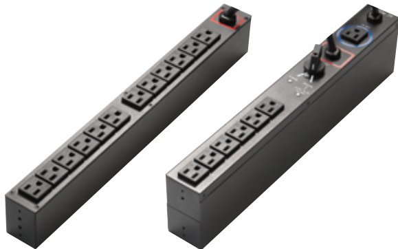
Optional FlexPDU and HotSwap MBP for greater flexibility and uptime